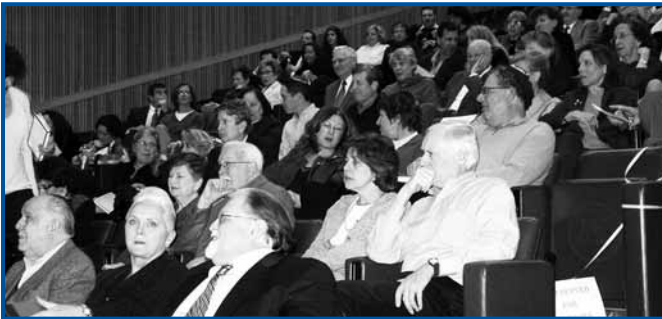
The auditorium was filled with alumni, parents and community members.