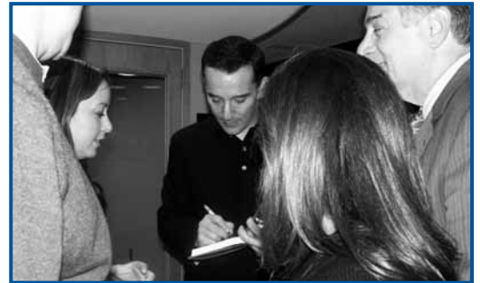
"Why Faith Matters" The book signing was a sell out.